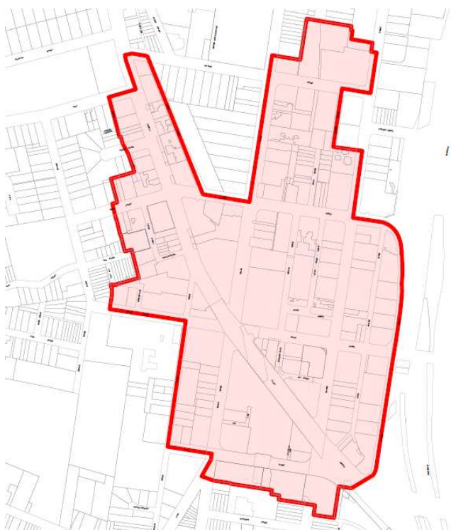
Figure 1 North Sydney Centre (in red) overlaid cadastre map

It is noted that the North Sydney Centre is immediately adjacent to established residential areas and heritage items/conservation areas. These areas are particularly sensitive to amenity impacts that may result from development that occurs within the North Sydney Centre.